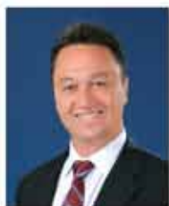
Henry J. Mancini