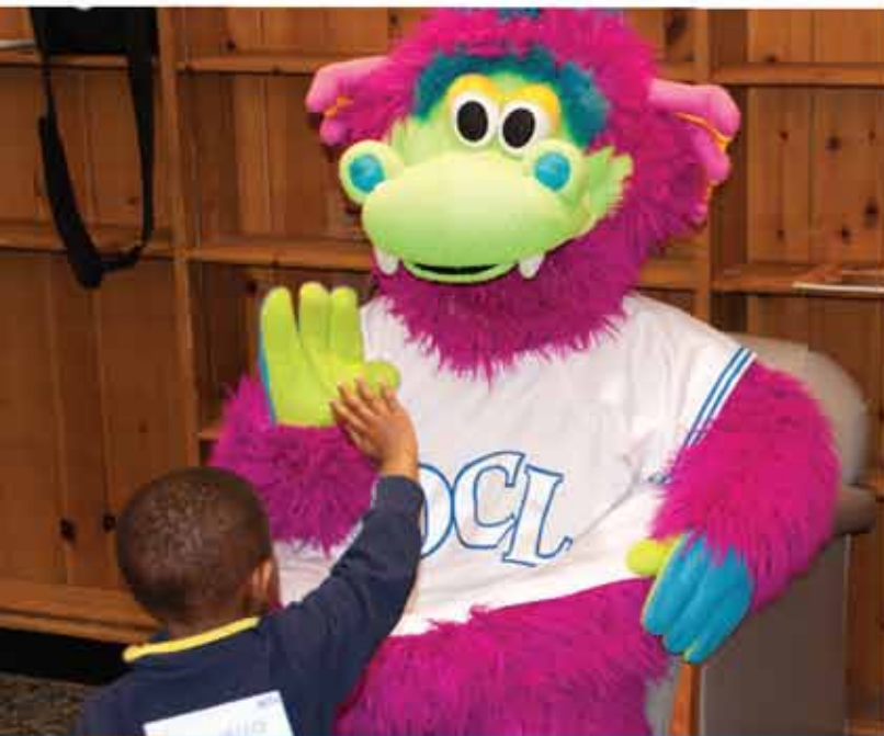
Left Photo: The Ocean County Library's own mascot dragon, Sparks, makes friends with a young fan giving high-fives at a Pizza Party. Children laughed, played and enjoyed a picnic during the party which featured four learning stations which involved motor skills, coordination, listening and depth perception.