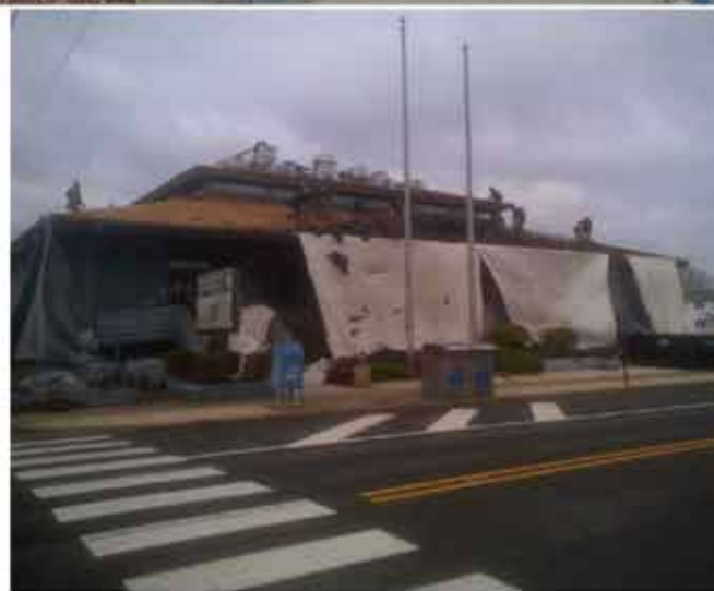
Top Photo: Long Beach Island Branch building stands stronger and more attractive than ever during its 25th anniversary following repairs to its interior and exterior in 2014.