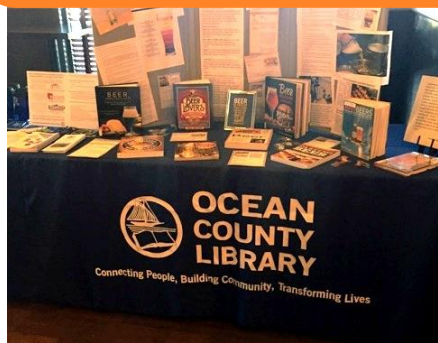
Display at Cornerstone